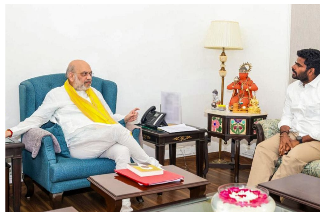
While Annamalai was given a free hand by the BJP, the party's performance in Tamil Nadu had already witnessed a noticeable decline in the April-May 2026 Assembly elections, when