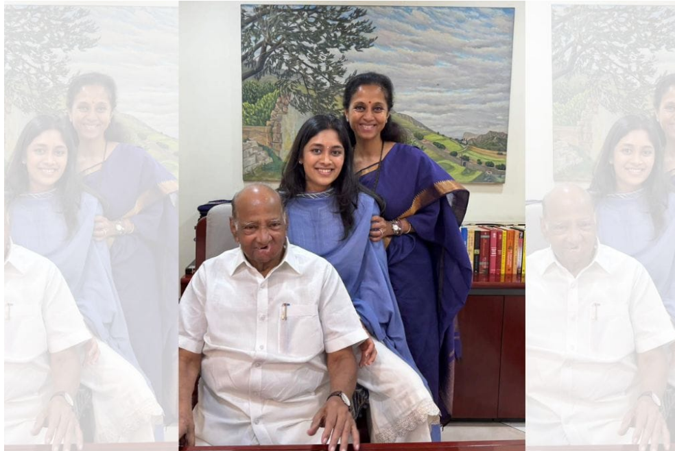
Contradiction or not, the episode highlights a reality that has long existed in India's politics: political rivalries do not always translate into personal ones. Despite fierce battles in public, politicians and their families have often maintained relationships across party lines. Political analyst